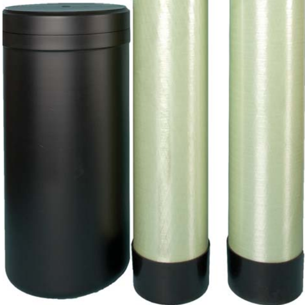
Model Shown: 1.5" 300 Alternating Twin Configuration