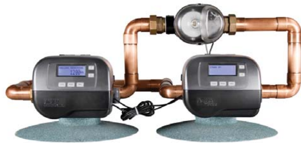
Model Shown: 1.5" Alternating Twin in Copper